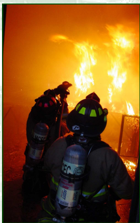
Training at Delaware State Fire School

We respond to an average of 1,100 fire emergencies and over 3,000 medical emergencies per year. To meet this demand, we must maintain a large and active volunteer population.