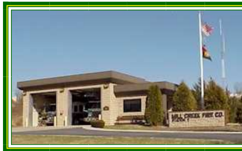
Station 2 4021 Skyline Drive Pike Creek, DE 19808 ( 302 ) 992-9671