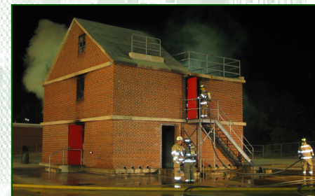
Training at Delaware State Fire School

Joining the Mill Creek Fire Company will allow you to: