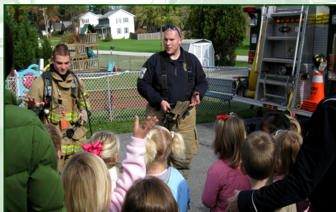
Fire gear demonstration at a local school

Volunteers are encouraged to participate in public relations. PR events include fire safety talks, station tours, a mobile fire safety education house, and Santa Claus runs during the winter holiday season.